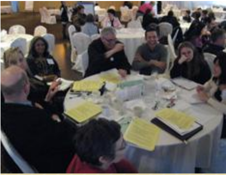
Roundtable discussions at the March 2012 Poverty Dialogue

Place-based strategies that build upon assets and resources at the neighbourhood level can help to lift low income families and individuals out of poverty.