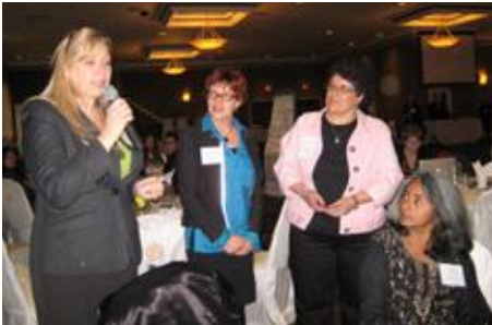
Participants provide feedback at the March 2012 Poverty Dialogue.

The Plan represents a starting point — a commitment by the community to take action.