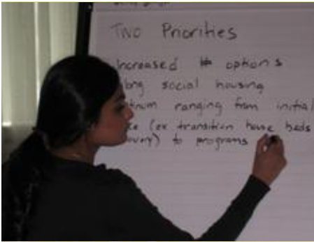
The March 2012 Poverty Dialogue engaged the community in developing the Surrey Poverty Reduction Plan